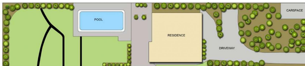
41 Edward Street, Sylvania