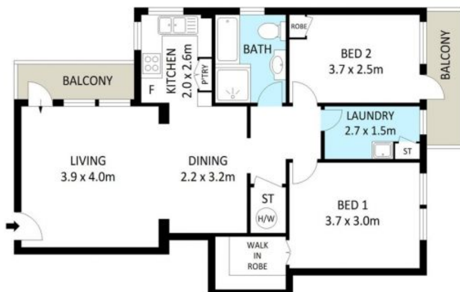
ELEVATED GROUND FLOOR