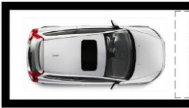
Garage 5.8 x 2.8m