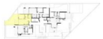
Unit Type 2

Internal Area: 56m 2 External Area: 48m 2 Unit(s): 2