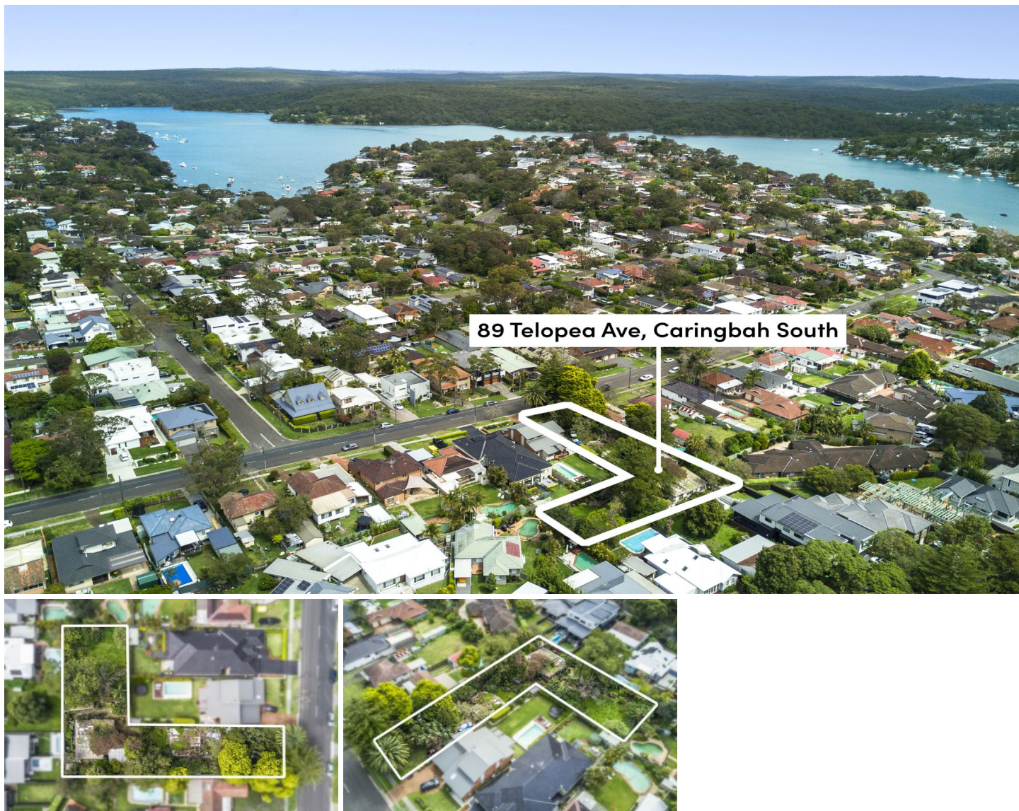
89 Telopea Ave, Caringbah South